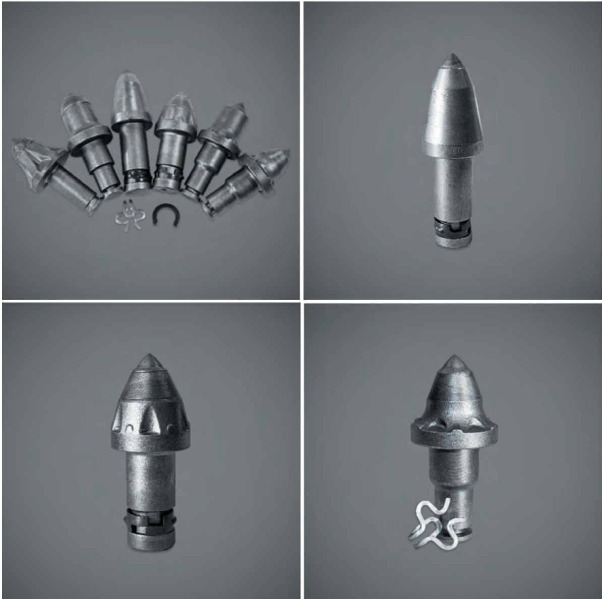
Fig. 1. Examples of the bits manufactured by Betek [2]

An extremely important element in the design of the bit is the correct technique of connecting the sintered carbide insert to the body, as well as the composition of the brazing compound itself, which is produced in-house and constitutes a Betek trade secret. The connection made in this way fills one hundred per cent of the space between the insert and the body of the bit. This is fundamental to the durability of the bit and the absence of situations in which the insert falls out during a mining operation.