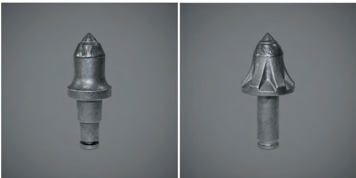
Fig. 5. Examples of Betek bits with a protective layer in the working (point) section [2]

In general, any increase in the service life of cutting tools has an impact on improving the efficiency of the entire mining system by reducing the frequency of tool replacement.